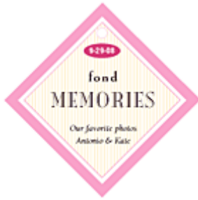
Photo Place Cards

Hang Tags with string: A lot of choices here, string tags, merchandise tags, etc. People can hang them directly on their camera as a reminder to upload them after the event